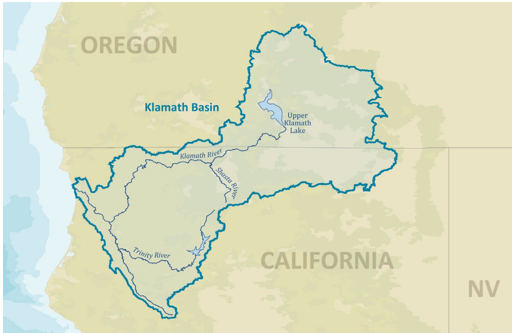
Figure 3. Target geography for the Conservation Partners Program

For the Conservation Partners Program: Projects must be located on private agricultural working lands in the Klamath River Basin.