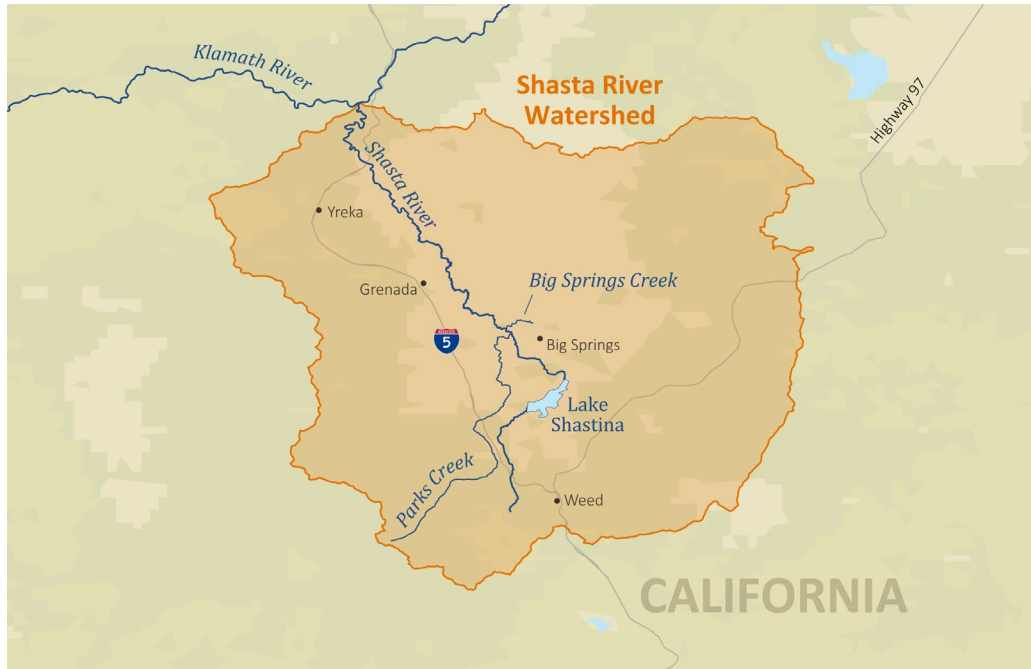
Figure 2. Target geography for the Shasta Valley Regional Conservation Partnership Program

For the Shasta Valley Regional Conservation Partnership Program: Projects must be located within the Shasta River watershed including Big Springs Creek, Parks Creek, or other tributaries.