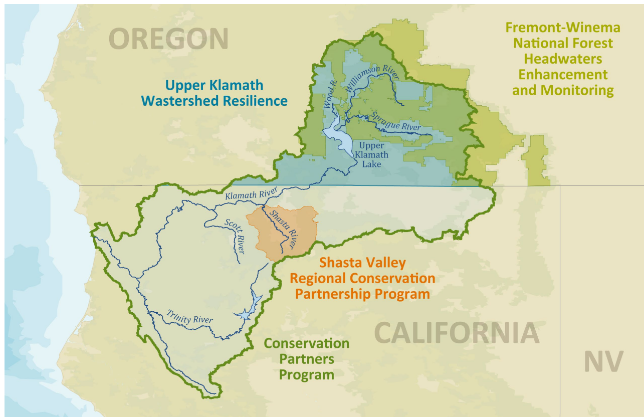
Figure 1. Target geographies for all funding opportunities