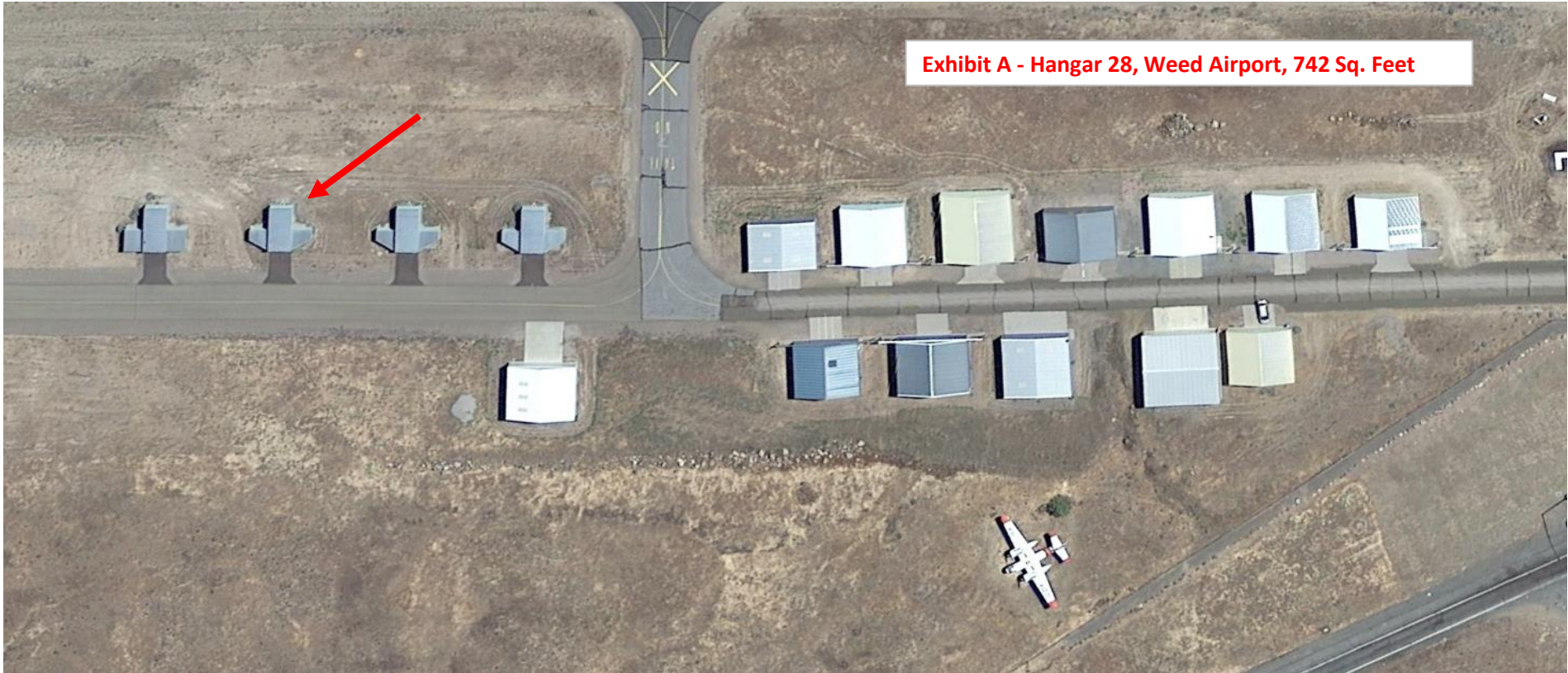
Exhibit A - Hangar 28, Weed Airport, 742 Sq. Feet